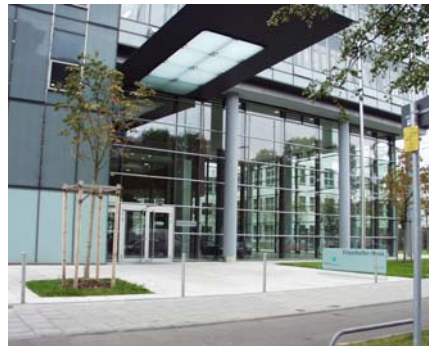
'Fraunhofer Haus', front desk, Hansastrasse 27c

Take the 'U-Bahn' U 4 or U 5 from 'Hauptbahnhof', direction to 'Laimer Platz', exit at 'Heimeranplatz'. Follow the signs to 'Hansastrasse', turn left and register at the front desk in 'Fraunhofer Haus' at Hansastrasse 27c Commuting time approx. 10 min